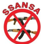
South Sudan Action Network on Small Arms