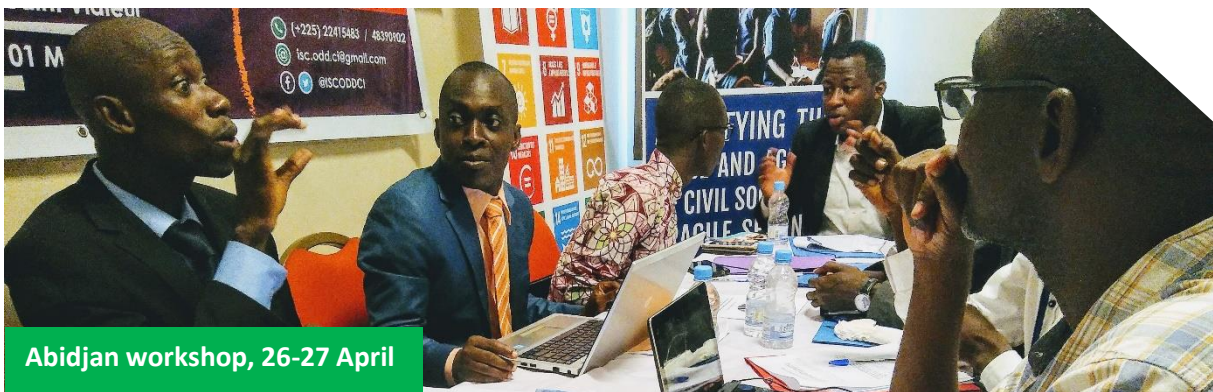
Abidjan workshop, 26-27 April