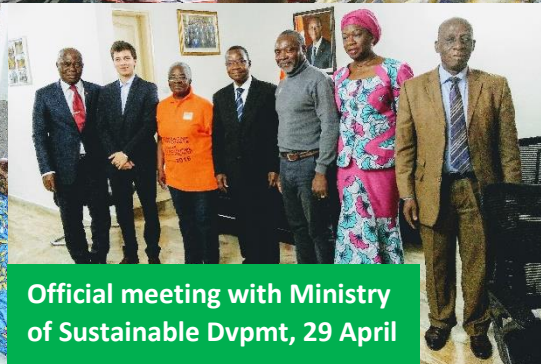
Official meeting with Ministry of Sustainable Dvpmt, 29 April