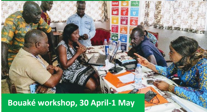
Bouaké workshop, 30 April-1 May