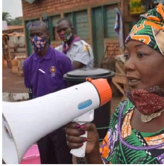
CSPPS - Freetown/Sierra Leone