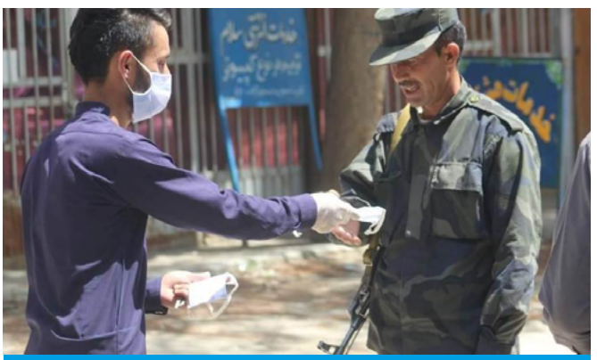
CSPPS - Kabul/Afghanista

"One aspect that civil society is becoming heavily involved in, however, is the eradication of misinformation, and the spread of COVID-19 informative messages to the more remote communities. WhatsApp is proving to be one of the most convenient channels for the purpose of raising awareness, but also local radio stations could be involved in this process.