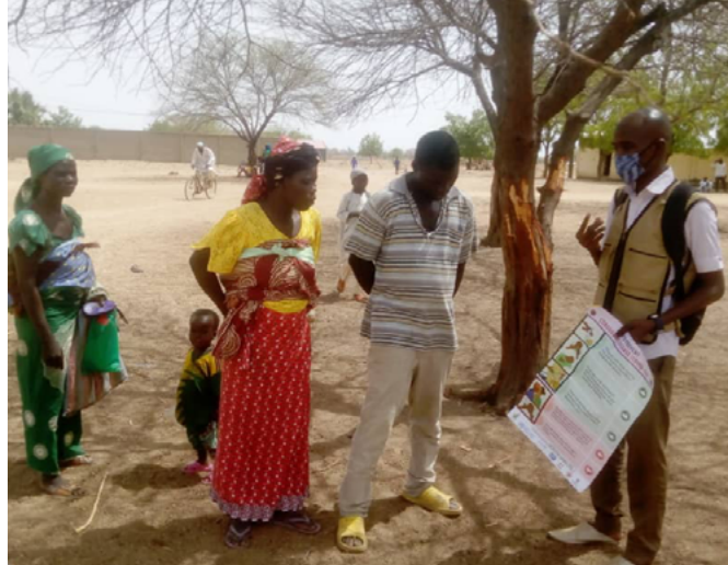
CSPPS - Vaounde/Cameroon

Many members moreover report distributing PPE, often alongside awareness-raising activities, as well as aid to struggling households, including food, medication, household items and small cash donations. In Afghanistan, for instance, our member Afghans for Progressive Thinking reportedly raised more than 10,000USD to assist over 120 families that were among the most socioeconomically impacted by the pandemic. In Burundi, Réseau femmes et paix distributed sanitary kits to female vendors in Bujumbura. And in Yemen, responding to an appeal from the Taiz Governorate Health Office, our member Youth Without Borders Organization for Development (YWBOD), supported by UK Aid and CSPPS-member Saferworld, offered support to two public hospitals by providing oxygen tanks, sterilising equipment, PPE and more. YWBOD has also been asked to help train police on how to approach confirmed and suspected cases of COVID-19 in safe and non-violent ways.