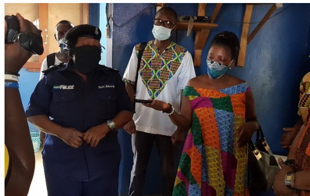
Distribution of face masks by the CSPPS Country Team in Sierra Leone to the West End Police Station in Freetown.

Within the IDPS tripartite structure, CSPPS spurred the release of an IDPS joint statement calling upon all relevant stakeholders (both state and non-state actors) worldwide to abide by the motto of the 2030 Agenda: leaving no one behind. Drawing from our experience with the Ebola outbreak, CSPPS recognised the importance of a holistic, cross-sectoral and whole-of-government response, supported by partners across the humanitarian-development-peace triple nexus, in tackling COVID-19 not only in fragile and conflict-affected settings, but in countries worldwide that may become more prone to violence due to the ongoing pandemic.