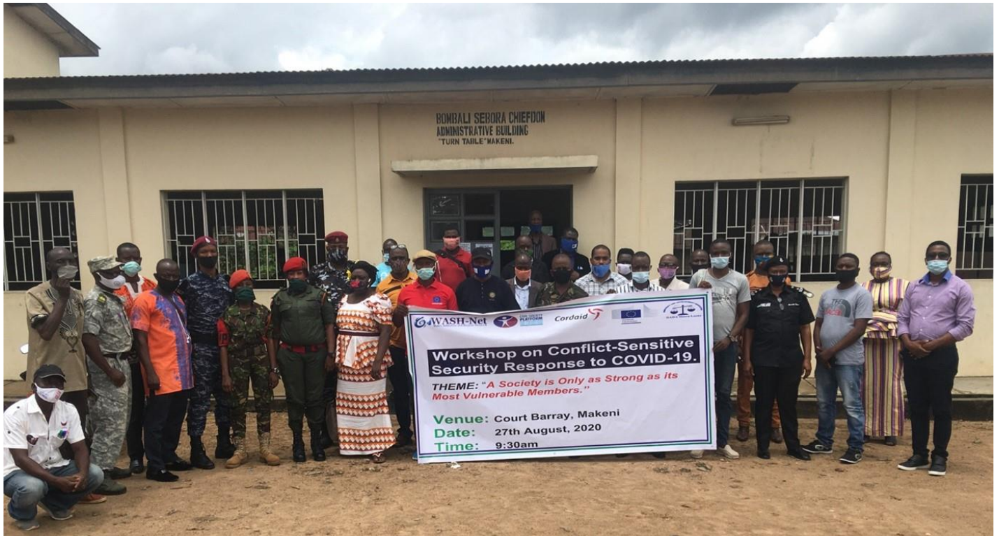
A workshop on conflict-sensitive security response to COVID-19 in Makeni, Sierra Leone.