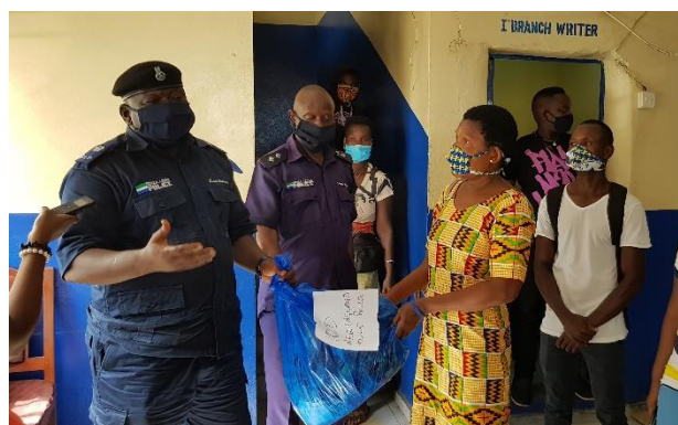
Distribution of face masks by the CSPPS Country Team in Sierra Leone.