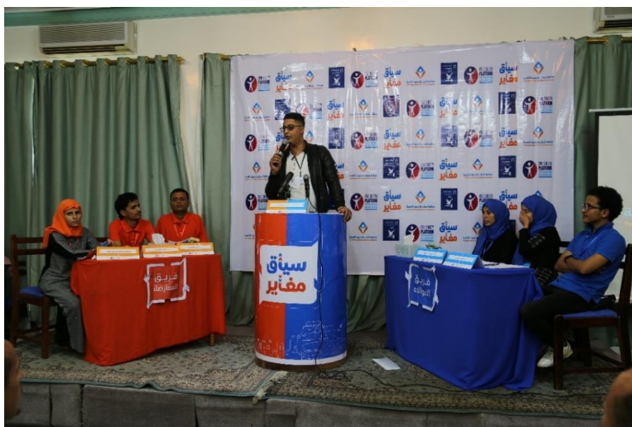
A debate taking place in the project 'Yemen Peace Voice II'. Credit: YWBOD.